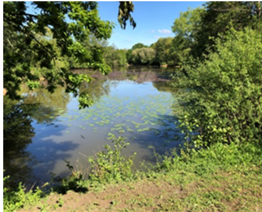
Figure 1.2.1: Photograph of the lake at Riverside Garden Park looking north west