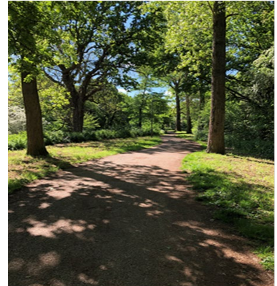
Figure 1.2.2: Photograph of NCR21 routing through Riverside Garden Park